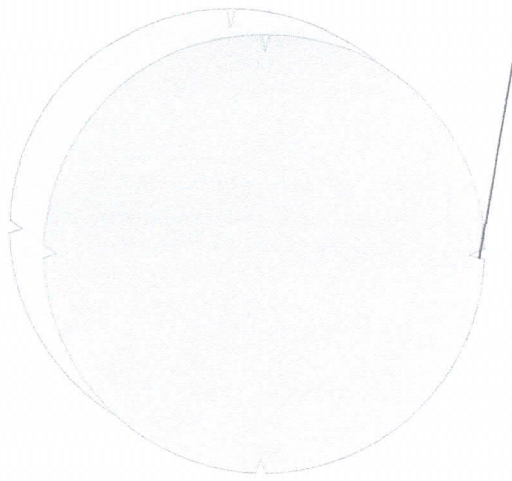
Clip at quarter marks

2. Create and mark the side section. • Join short 18" ends of the side section, right sides together, leaving a 2" opening for turning with a generous 1/4" seam. Finger press the seam open.